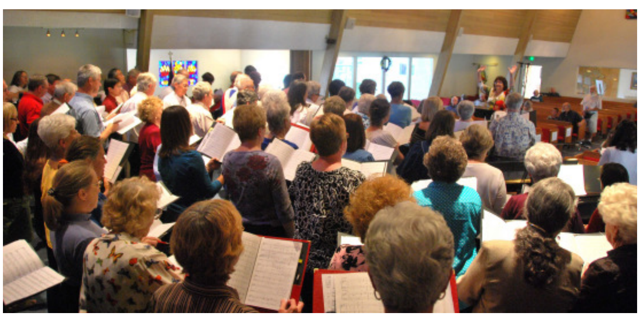
The Cluster Choir Festival takes place annually. FUMCAG hosts this event about every 3 years, as above in May of 2009. Hosting or not, the choir participates every year with a solo piece and a couple combined-choir pieces.