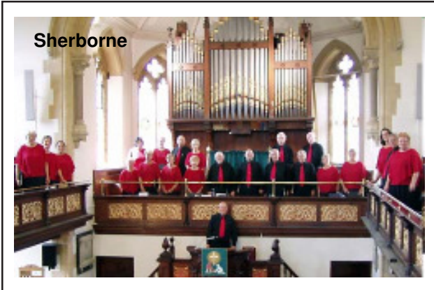
In July of 2006, the Chancel Choir did a Wesleyan tour of England, singing at these locations: Cheap Street Methodist Church in Sherborne, John Wesley's "New Room" Chapel near the Wesley home in Bristol, Bath Abbey, Christ Church at Oxford, and the Wesley Chapel in London. The choir occasionally sang impromptu, such as at a little church in Castle Combe (not pictured).