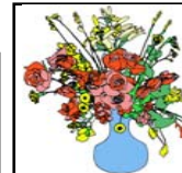
Flowers This Week

Join us in Criswell Hall after services.