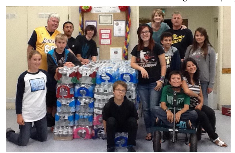
"Everyone who drinks this water will get thirsty again and again. Anyone who drinks the water I give will never thirst—<u>not ever</u>. The water I give will be an artesian spring within, gushing fountains of endless life." - Jesus