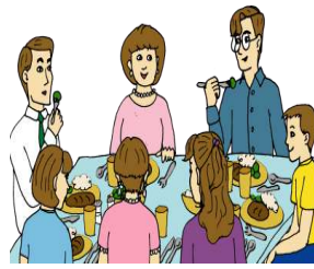
TABLE OF 8 PROGRAM

Layout Editor reserves the right to cut and edit articles to meet space limitations.