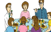
Table of 8 is an opportunity to make new church friends, enjoy food, and conversation.

Each group consists of 6 to 10 people who, as a group, will decide on the times and locations for their get-togethers.