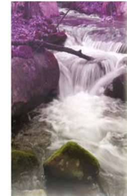
Exodus 17: 6