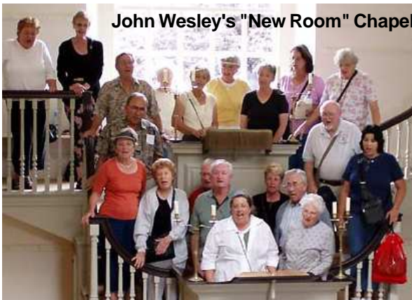
John Wesley's "New Room" Chapel