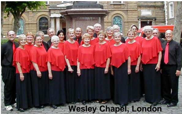
Wesley Chapel, London

The Cluster Choir Festival takes place the first Sunday of May each year. FUMCAG gets to host this event about every 3 years or so, as it did above in May of 2009. Hosting or not, the choir participates every year.