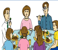
TABLE OF 8 PROGRAM

You are invited to sign up to sponsor altar flowers for a special occasion or memorial