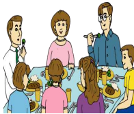
TABLE OF 8 PROGRAM

Do you want an opportunity to engage with fellow church members in a social setting? Sign up to be part of the Table of 8 program! SEE SIGN-UP INSERT IN THIS BULLETIN!