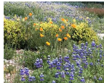
Melsheimers' duck pond and garden!

And many of us are reading – books for book clubs, classics, mysteries, books we always wished we had the time to read – even the Bible! I hope you have found things to help you during this time. Remember you can always call someone or send an email or even a “snail mail” greeting to someone. It will make their day and yours a little brighter! Stay healthy!