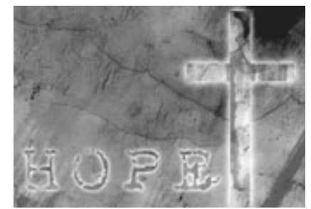
"If any of you want to be my followers, you must forget about yourself. You must take up your cross and follow me."