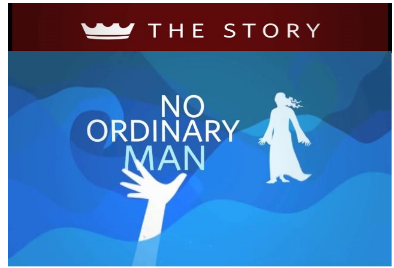
Mark 4: 1—9